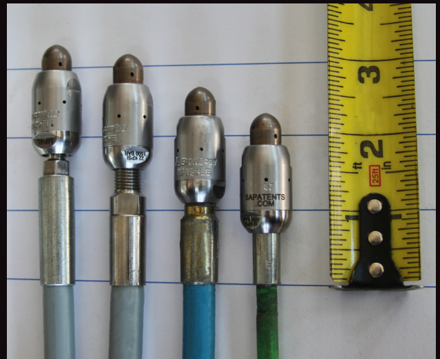
The shortest rigid length configuration, including the hose crimp, is made with 3mm hose and 1/16" pipe thread end. The 1/8" pipe thread on 5 mm hose is the next shortest configuration.